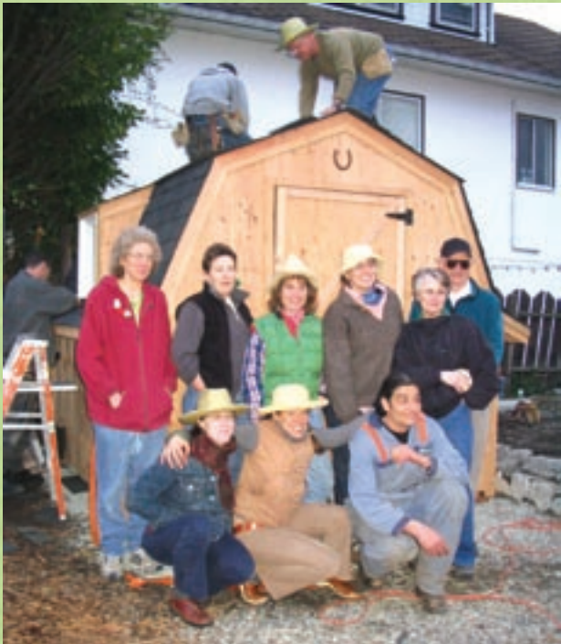
Rayn or Shine gardeners at the barn raising.